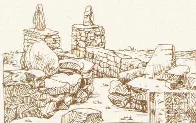
Stone seats, a modern Stonehenge.