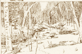
Battle Swamp Brook flows under stone bridge.